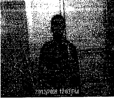
Ist Party न्यासकर्ता

Reg. No. 11933 Reg. Year 2009-2010 Book No. 4